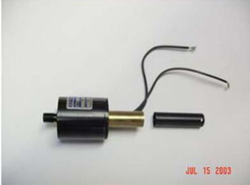
1214 1333 921 B pin type stop solenoid .jpg