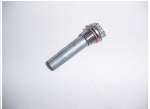
1711 1329 197 Anode and bolt .JPG