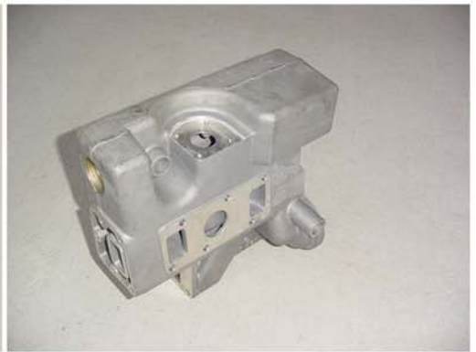
1153 1333 323 D35 tank 022.jpg