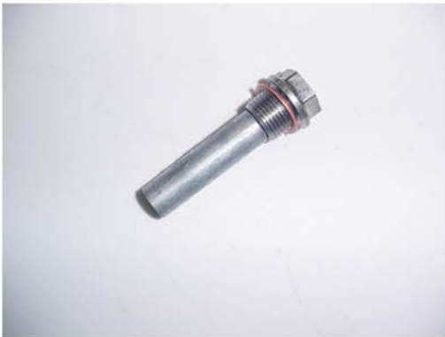
1711 1329 197 Anode and bolt (1).JPG