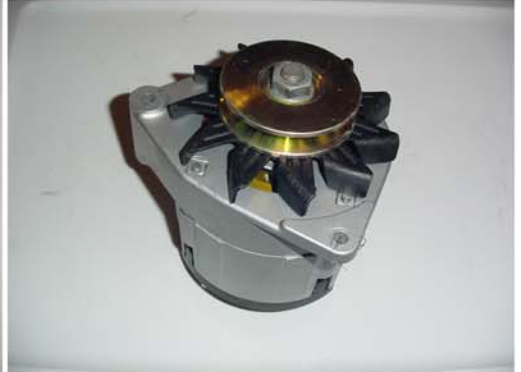
1231 1333 935; REBUILT A.JPG