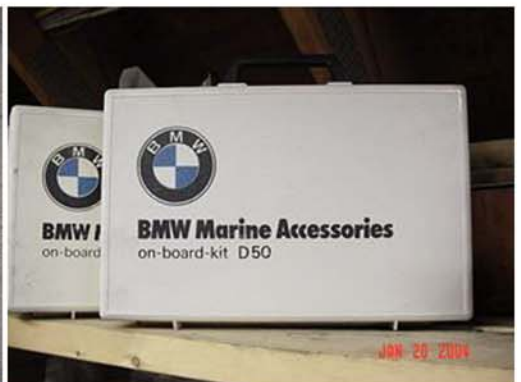
7461 1333 742 On Board Kit.jpg