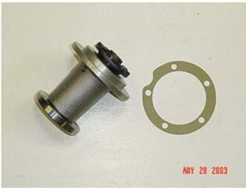
1151 1333 330 D50 2 Coolant pump.jpg