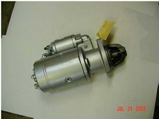
1241 1329 906 D50 starter .jpg