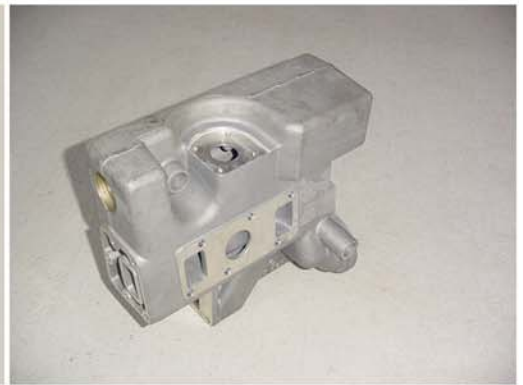
1153 1333 323 D35 tank 022.jpg