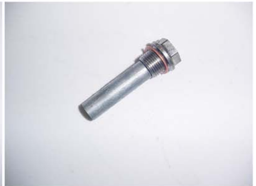
1711 1329 197 Anode and bolt .JPG