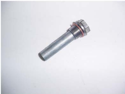
1711 1329 197 Anode and bolt (1).JPG