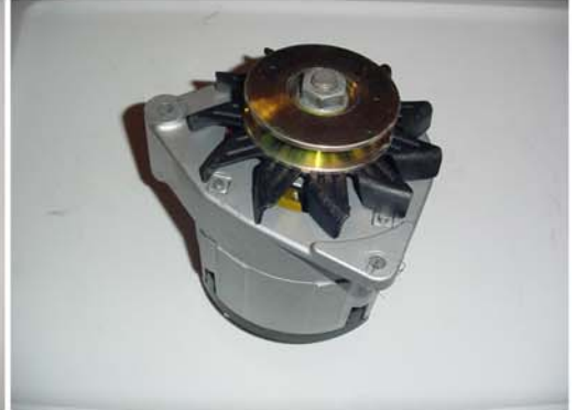
1231 1333 935; REBUILT A.JPG