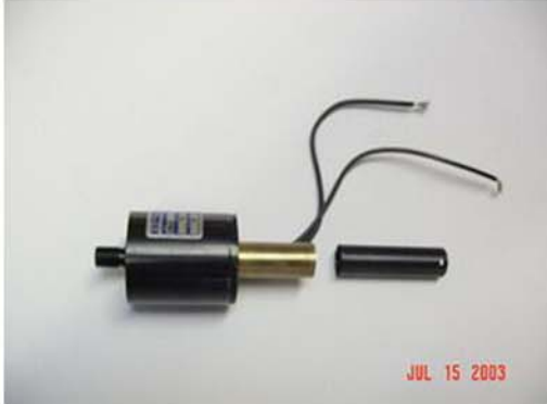
1214 1333 921 B pin type stop solenoid .jpg