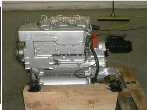
D50-2 Left side.jpg