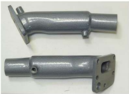
1162 1333 344 D50-2 Exhaust pipe new .JPG