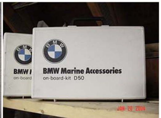
7461 1333 742 On Board Kit.jpg