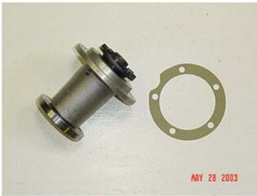
1151 1333 330 D50 2 Coolant pump.jpg